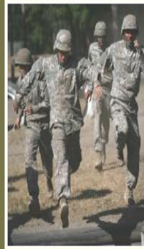
State Specific Grant Opportunities