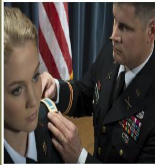
Army Reserve or National Guard Opportunities